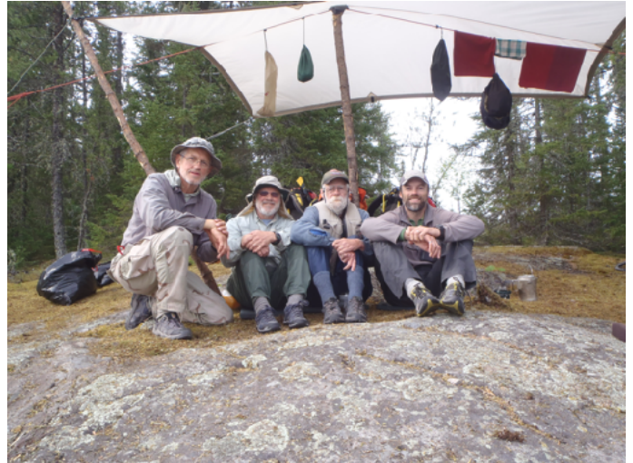
Leaving a legacy. The average age of Wabakimi Project participants is over 65.