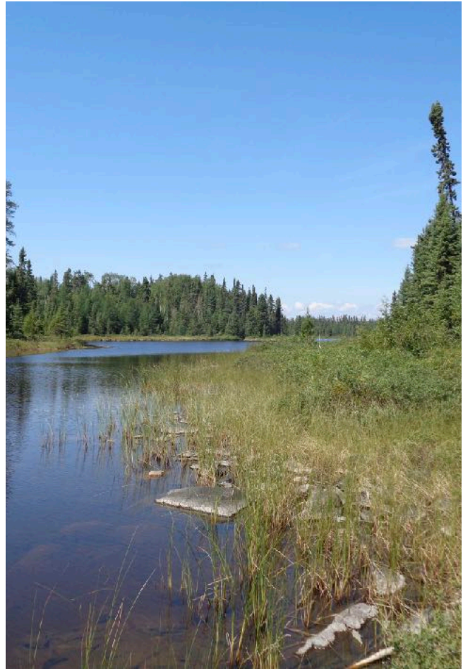
Exploring new territory searching for a possible route between Cosmo Lake and D'Alton Lake

To date, 199 volunteer trip leaders and participants from North America and Europe have collectively spent a total of 1,099 days on 133 trips exploring and mapping the canoe routes of the Wabakimi Area. Together, they have travelled 4,826km ( 2,999 miles) through this vast, virtually-roadless wilderness area, located and inventoried 924 campsites and located and rehabilitated 938 portages whose measured lengths have totalled 243,267m ( 266,040 yards or 48,371 rods).