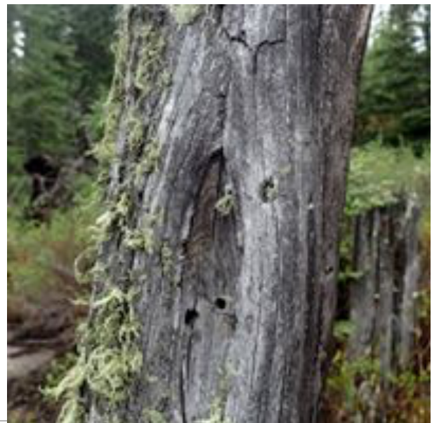
An ancient blaze